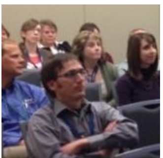
Health Reform 101

follow on Twitter | friend on Facebook | forward to a friend