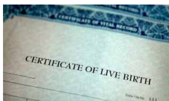
Any other document that has your name on it