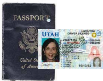
Expired driver's license or passport