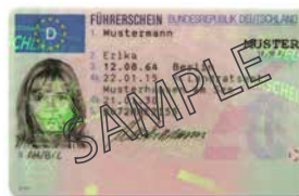
Driving privilege cards from another country