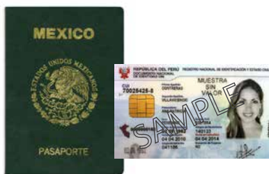
Foreign issued government ID

Examples of some types of ID you could use that have your name on it: