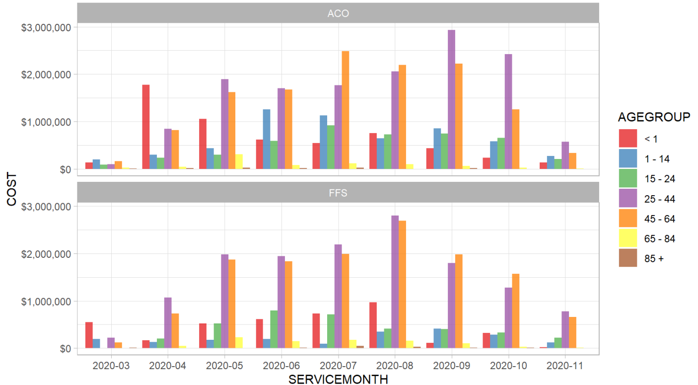
Table 11: COVID-19 Like Illness Costs by Delivery System, Age Group